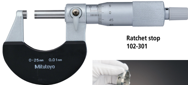
Ratchet stop 102-301