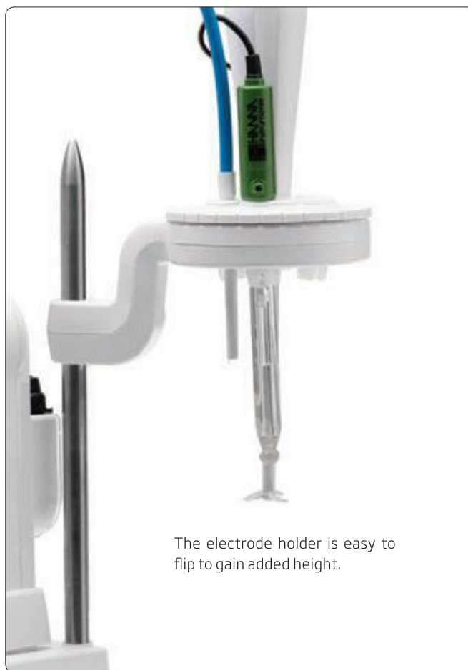
The electrode holder is easy to flip to gain added height.

The HI931 offers support for one analog board to allow an electrode, a stirrer, and up to two burettes to be connected to one unit simultaneously.