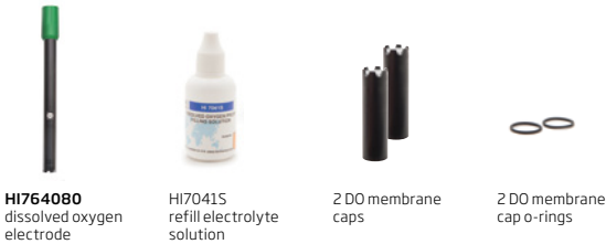
HI764080 dissolved oxygen electrode HI70415 refill electrolyte solution 2 DO membrane caps 2 DO membrane cap o-rings

edge®DO: HI2004-01 (115V) and HI2004-02 (230V) also includes: