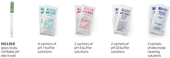
HI11310 glass body, refillable pH electrode 4 sachets of pH 7 buffer solutions 2 sachets of pH 4 buffer solutions 2 sachets of pH 10 buffer solutions 2 sachets of electrode cleaning solutions

edge®pH: HI2002-01 (115V) and HI2002-02 (230V) also includes: