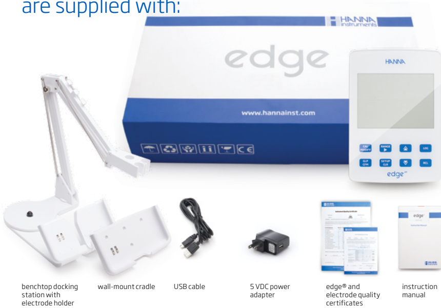
benchtop docking station with electrode holder wall-mount cradle USB cable 5 VDC power adapter edge® and electrode quality certificates instruction manual

All edge® single parameter meters are supplied with: