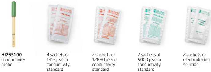
HI763100 conductivity probe 4 sachets of 1413 µS/cm conductivity standard 2 sachets of 12880 µS/cm conductivity standard 2 sachets of 5000 µS/cm conductivity standard 2 sachets of electrode rinse solution

edge®EC: HI2003-01 (115V) and HI2003-02 (230V) also includes: