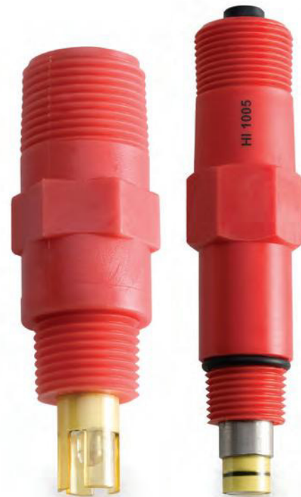
HI1000 and HI2000 series