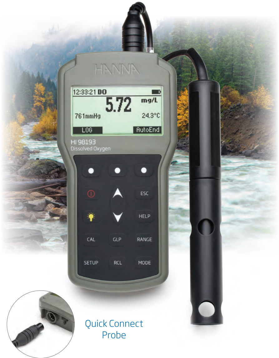
Quick Connect Probe