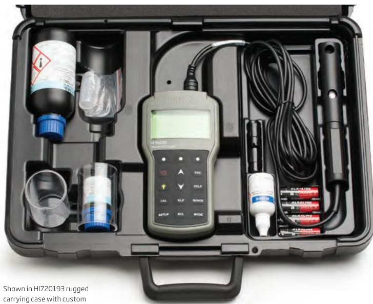
Shown in HI720193 rugged carrying case with custom thermoformed insert (included)