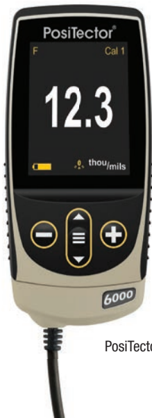
PosiTector 6000 FHXS3