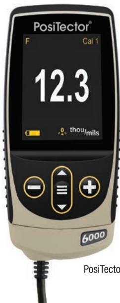
PosiTector 6000 FJS1