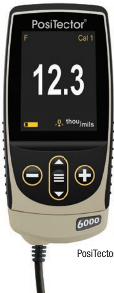
PosiTector 6000 FLS1