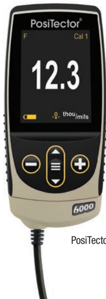
PosiTector 6000 FNRS1