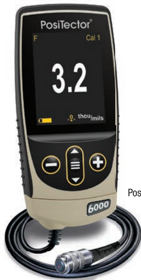
PosiTector 6000 FNS1