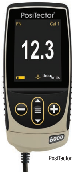
PosiTector 6000 FNTS3