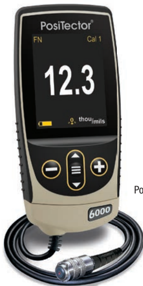
PosiTector 6000 FTS1