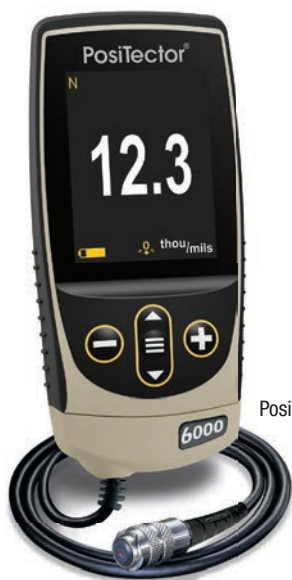
PosiTector 6000 NAS1