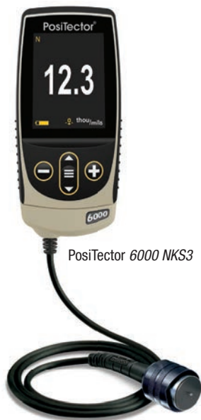
PosiTector 6000 NKS3