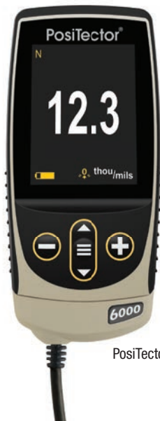
PosiTector 6000 NRS1